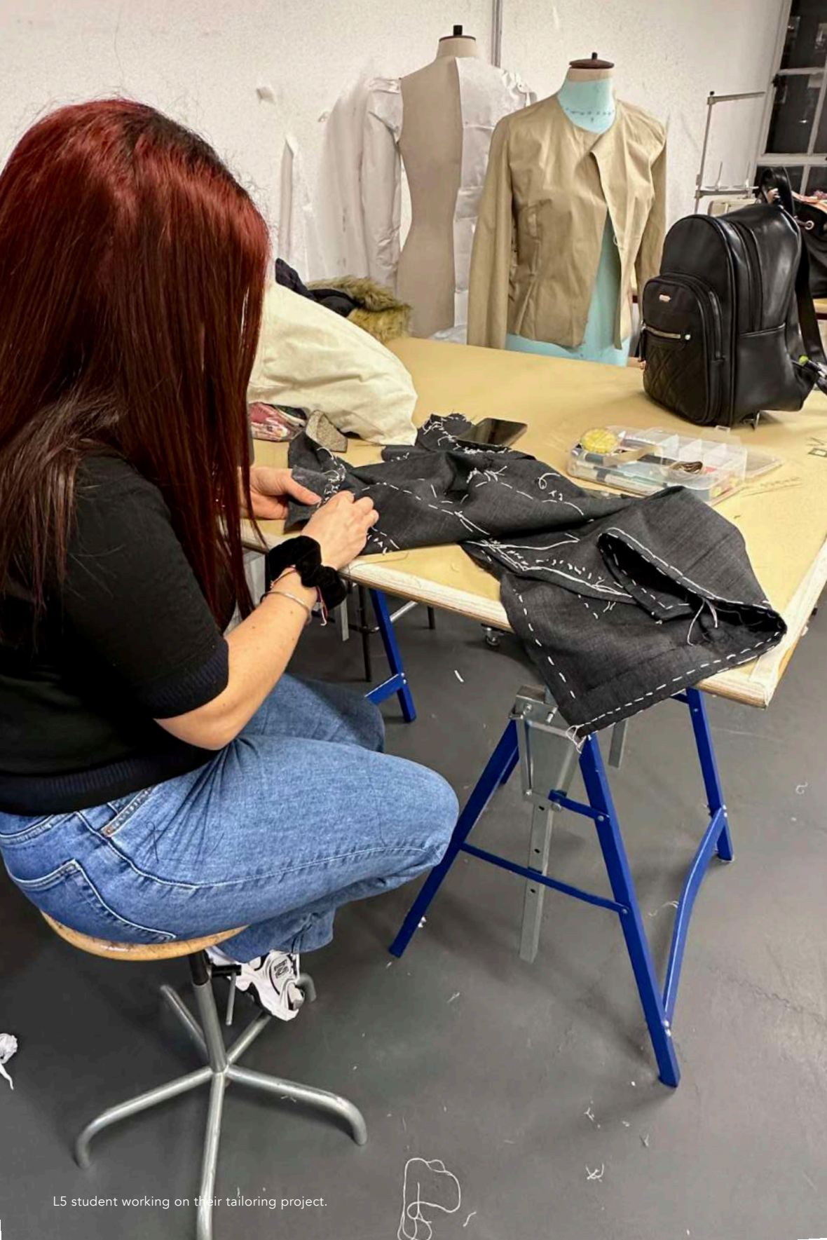
L5 student working on their tailoring project.