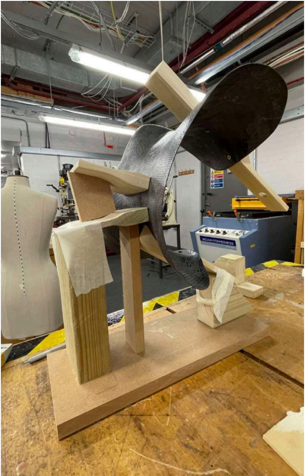
Fibre glass corset being constructed by Oliver Selic.