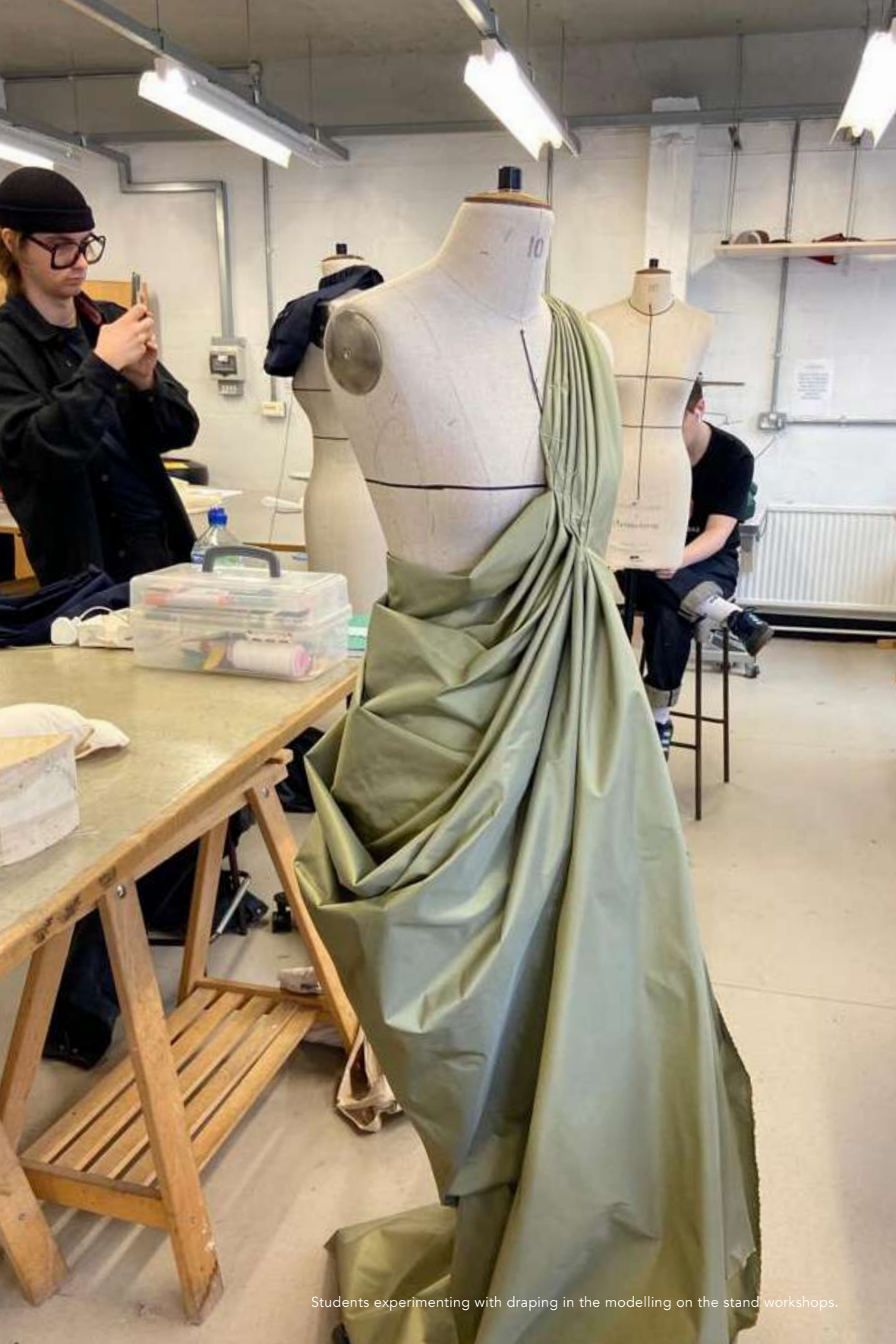
Students experimenting with draping in the modelling on the stand workshops.