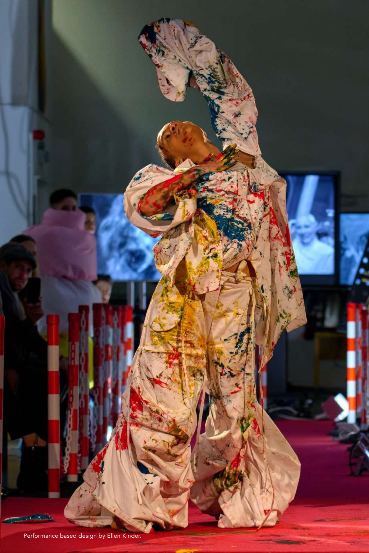
Performance based design by Ellen Kinder.