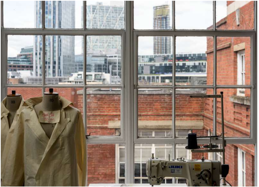
View of the city from the pattern cutting studio.