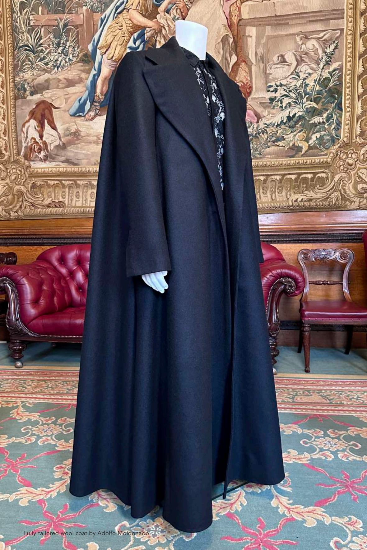
Fully tailored wool coat by Adolfo Moldonado.