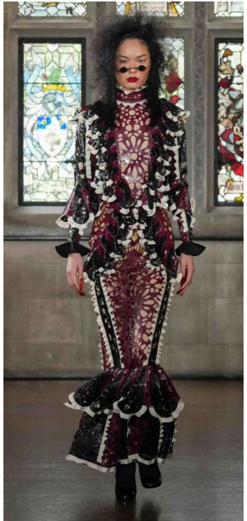
Left: look from Oliver's graduate collection; right: latex dress shown at London Fashion Week for Edward Crutchley.