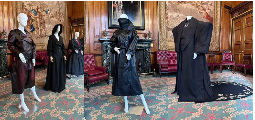
Tailored looks on display at The Drapers Company.