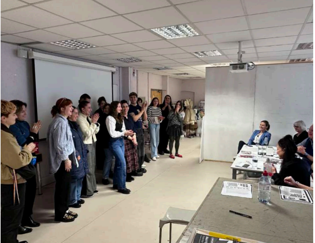
Final tailoring project presentations to panel from The Drapers Company.