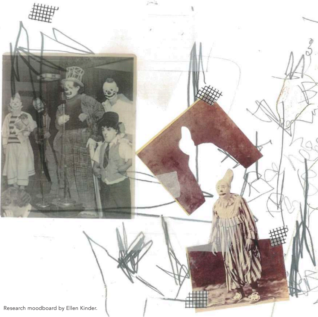
Research moodboard by Ellen Kinder.