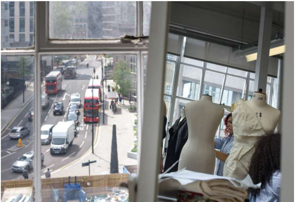
View of the city from the sewing studio.