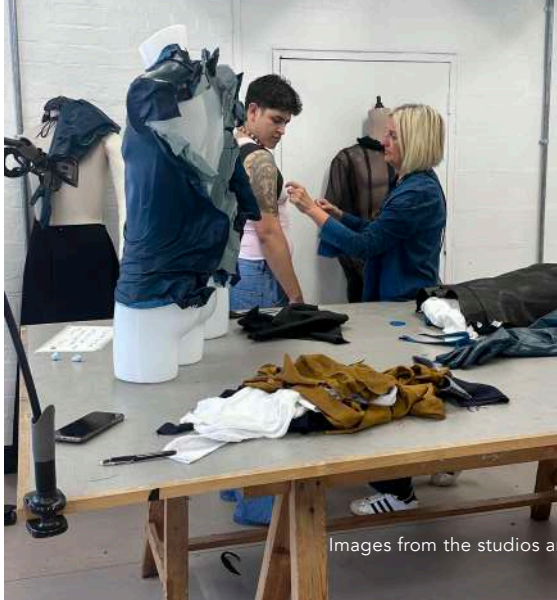
Images from the studios and a research trip to the Bishopsgate Institute near by.