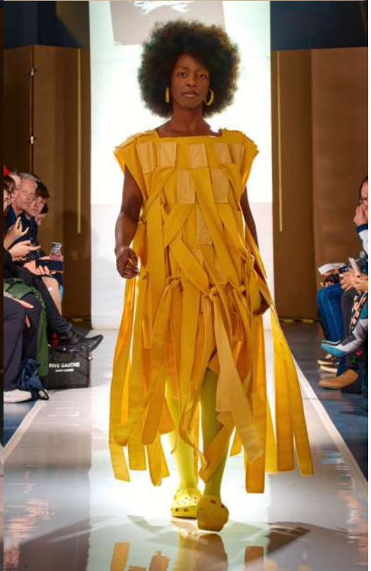
Images from L4 fashion shows.