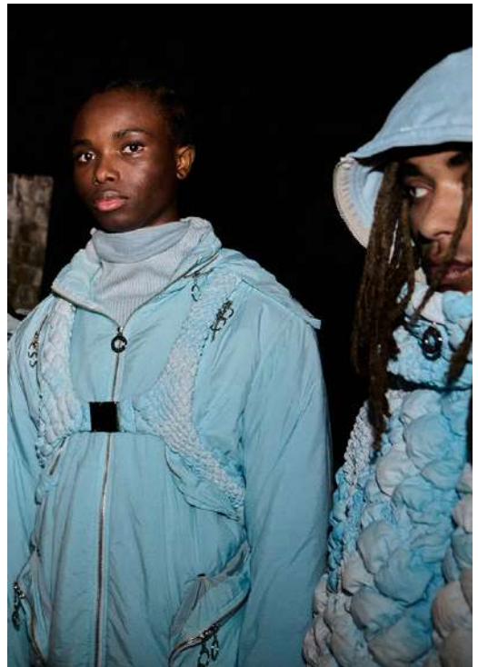
Charlie's FW24 collection featured on Hype Beast and HLorenzo.