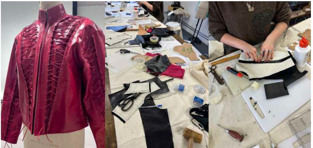
Images of leather jackets made from the leather workshops and the making process.