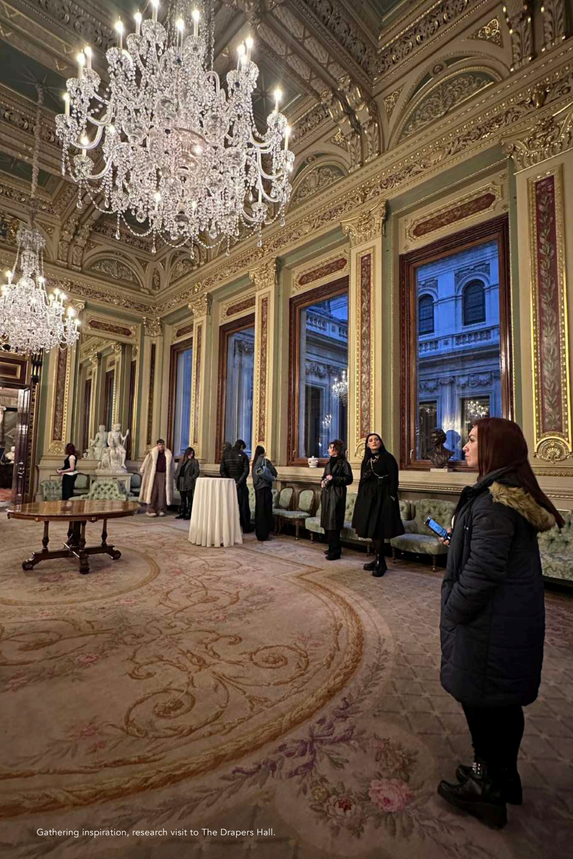
Gathering inspiration, research visit to The Drapers Hall.