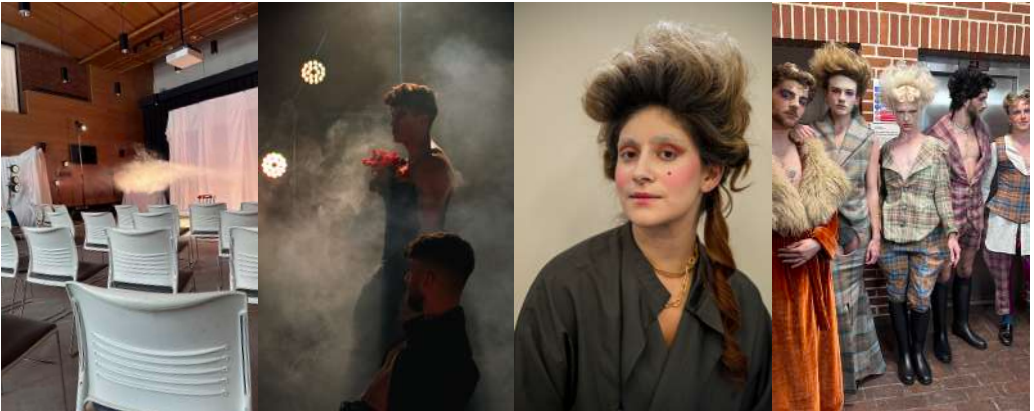
Behind-the-scenes mages from L6 graduate fashion shows.