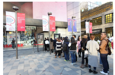
Great Creator Exhibition in China, Beijing 2015

our well established and ever popular Modern and Traditional Upholstery short course. Congratulations to the Upholstery team and the students for a hugely successful inaugural year, which culminated in an awards ceremony in June, giving students an opportunity to celebrate their achievements. A proud day at for all involved. Continuing our expansion of the short course portfolio, the first year of our Graphics and Illustration was well received and led to some inspirational and very creative work being produced by students. There have also been some new additions to our Jewellery and Silversmithing programme, including Recycle your Old Jewellery and Create a Jewel Using Enamel and this Summer has seen the successful second year of the Portfolio Preparation for 16-18 Year Olds (Architecture, Spatial Design and Interior Architecture). What's next? Well, expect some interesting new Photography short courses launching very soon and we are working on expanding our portfolio in all other areas. Proposals are always welcome so get in touch and remember staff and students get 20% off short courses. For further information, please get in touch. thecass.shortcourses@londonmet.ac.uk