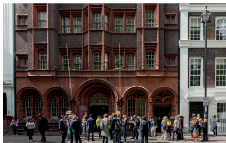
Soho Create at French Protestant Church 2015

This newsletter serves as an update on the work of The Projects Office in 2015-2016, and the exciting projects we are developing for 2016-2017.