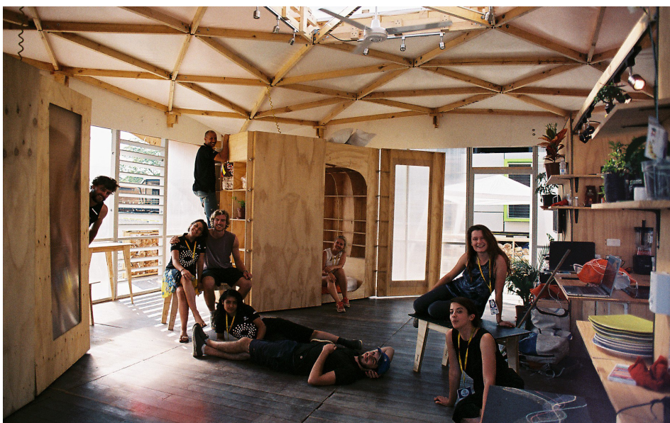
Solar Decathlon house and team in Santiago de Cali, Colombia

Cass Projects has been working in Hayes since 2012 at the invitation of local MP and Shadow Chancellor, John McDonnell. Projects have developed throughout the town; on the High Street, with local industries, on housing estates and now in and around the Grand Union Canal running through the town centre. This year BA Architecture Studio 3 has worked with canoeing club The Sharks to design a hub venue for both the club and local communities. The Studio