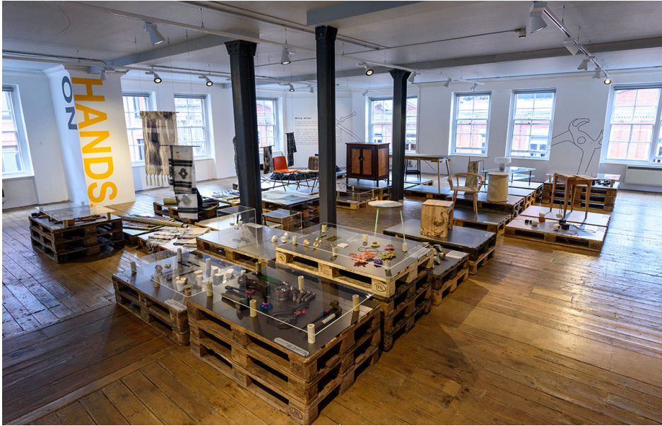
Hands On at The Aram Gallery

aims for this to become a built project during this coming academic year.