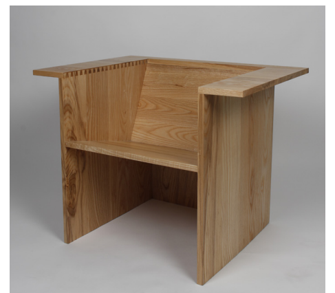
Chair for the 21C Reformer, Toynbee Hall