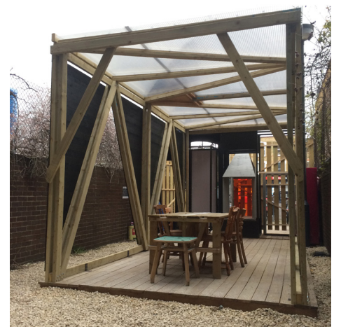
Community Hub, Roman Road