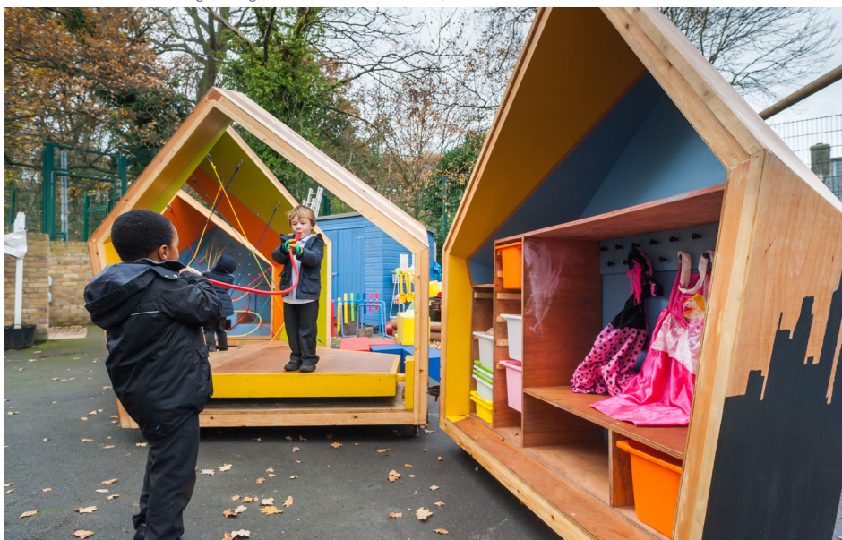
Learning by Play, Christchurch School

Cass Projects have provided exhibition design for an annual exhibition of Cass Architecture work at London Met's Rocket building in Holloway. The exhibition displays student nominations for the RIBA medals – one of the most prestigious international awards in architectural education. The student projects