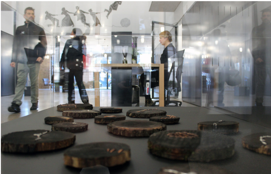
The Loom Gallery, Aldgate

shown were the university's nominations for RIBA Part 1 (Undergraduate) and RIBA Part 2 (Postgraduate) Architecture President's Medals.