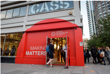
London Design Festival, Bank Gallery Central House

This newsletter serves as an update on the work of The Projects Office in 2016-2017, and the exciting projects we are developing for 2017-2018.