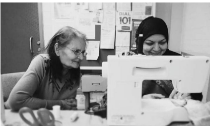
Middle: Made In Hayes sewing club