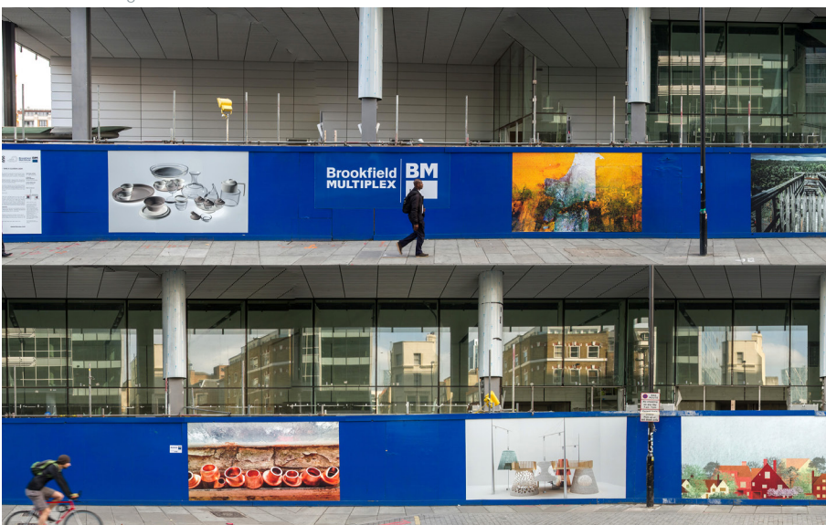
Below: Cass Image Walls

TimeCase: Memory in Action is a network of cultural organisations and practitioners from across Europe involved in a two-year programme of research into participatory cultural practices. The project explores the