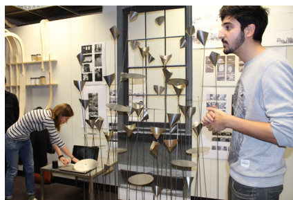
Above: Meet the Makers Crit Exhibition.