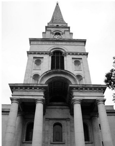
Above: The Huguenot Project, Fournier Street and Christ Church, Spitalfields.