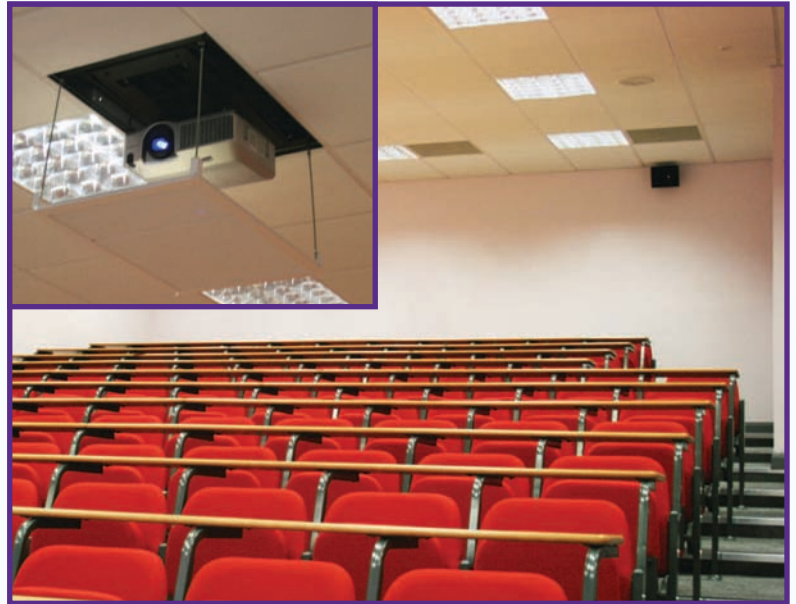
TMG-58 has a new drop-down projector and more seats

Additionally, TMG-58 has had the Audio/Video (AV) booth at the rear removed to make room for 33 extra seats and a retractable video projector fitted into the ceiling. TMG2-37 has also had its AV booth removed to create more seating space and received a number of smaller touches, such as the addition of coat hooks.