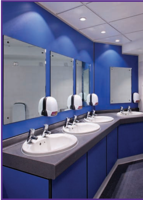
The improved toilets in Holloway Road's Learning Centre.

A second round of toilet upgrades are about to begin across both campuses.