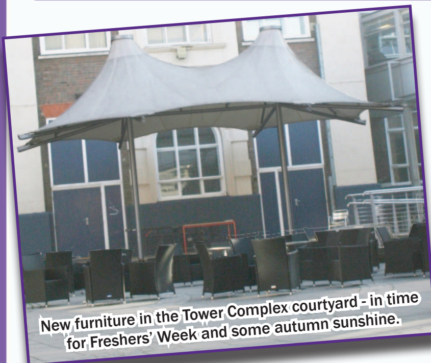
New furniture in the Tower Complex courtyard - in time for Freshers' Week and some autumn sunshine.