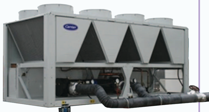
The new refrigeration unit uses cleaner gases

Stapleton House has had a new refrigeration unit installed on its roof. Other upgrades are being planned for all the significant buildings across both campuses.