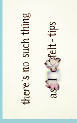
"There's no such thing" by C. Qualmann

17.00 – 21.00 Exhibition Open 18.00 – 20.00 Private View 19.00 Welcome and Launch Vocal Motions Elastic Theatre presents 'micro-performances' from 'Baroccata', a dance-opera