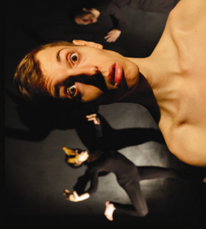
"Baroccata" by Vocal Motions Elastic Theatre